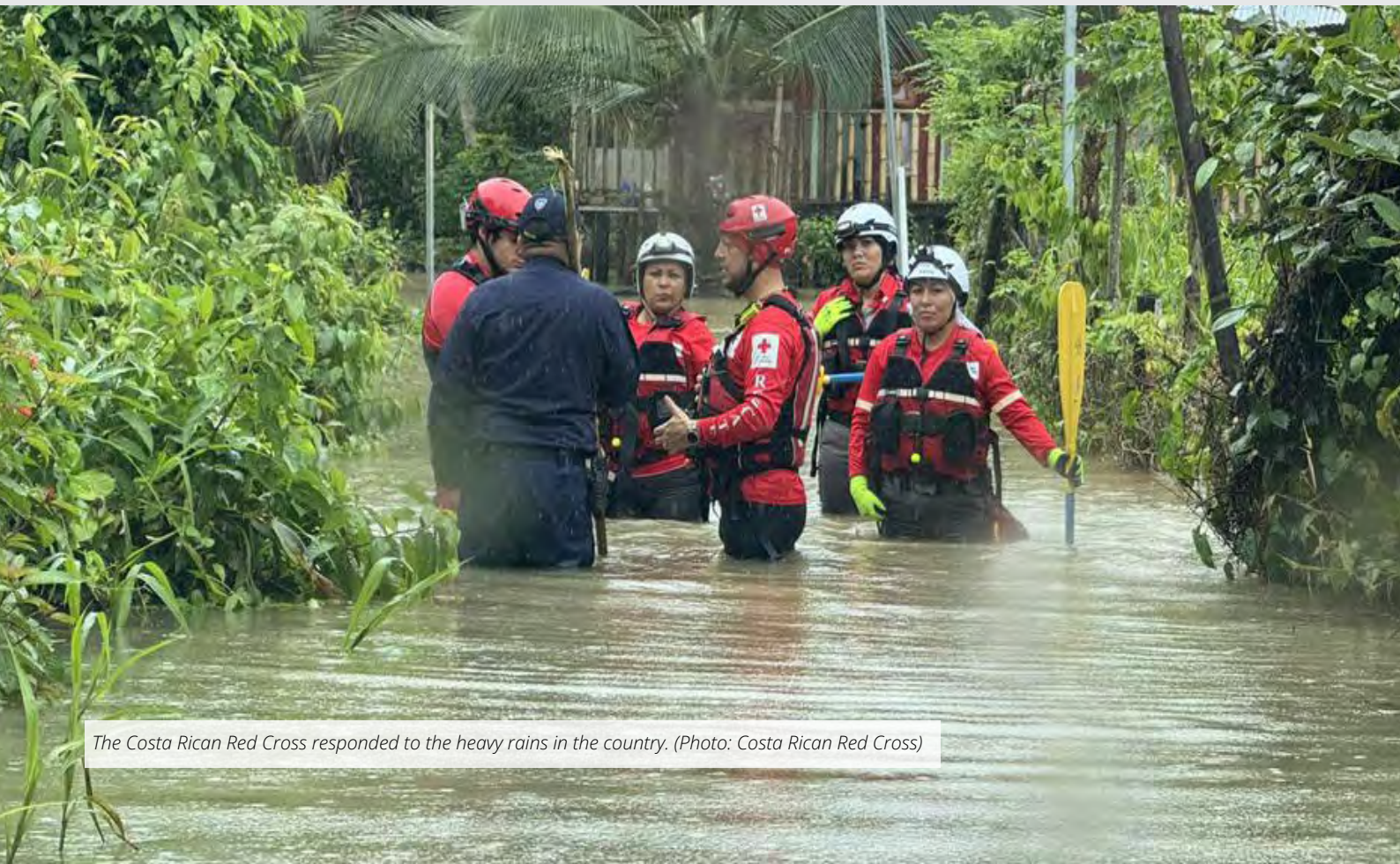
The Costa Rican Red Cross responded to the heavy rains in the country.

World Bank Population below poverty line 20%