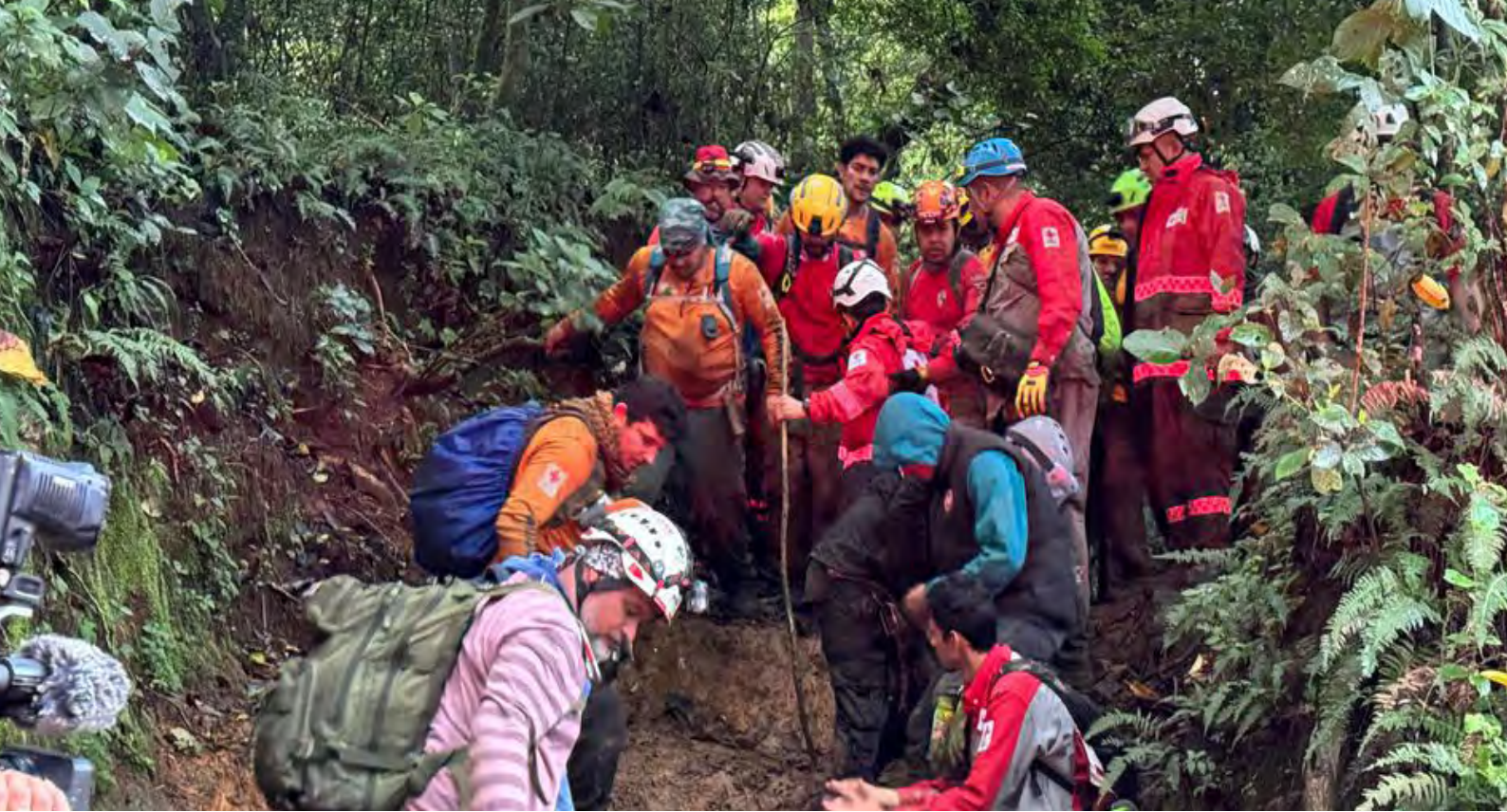
The Costa Rican Red Cross responded to an alert about an aircraft with six passengers that lost contact in the area of Cerro Pico Blanco.