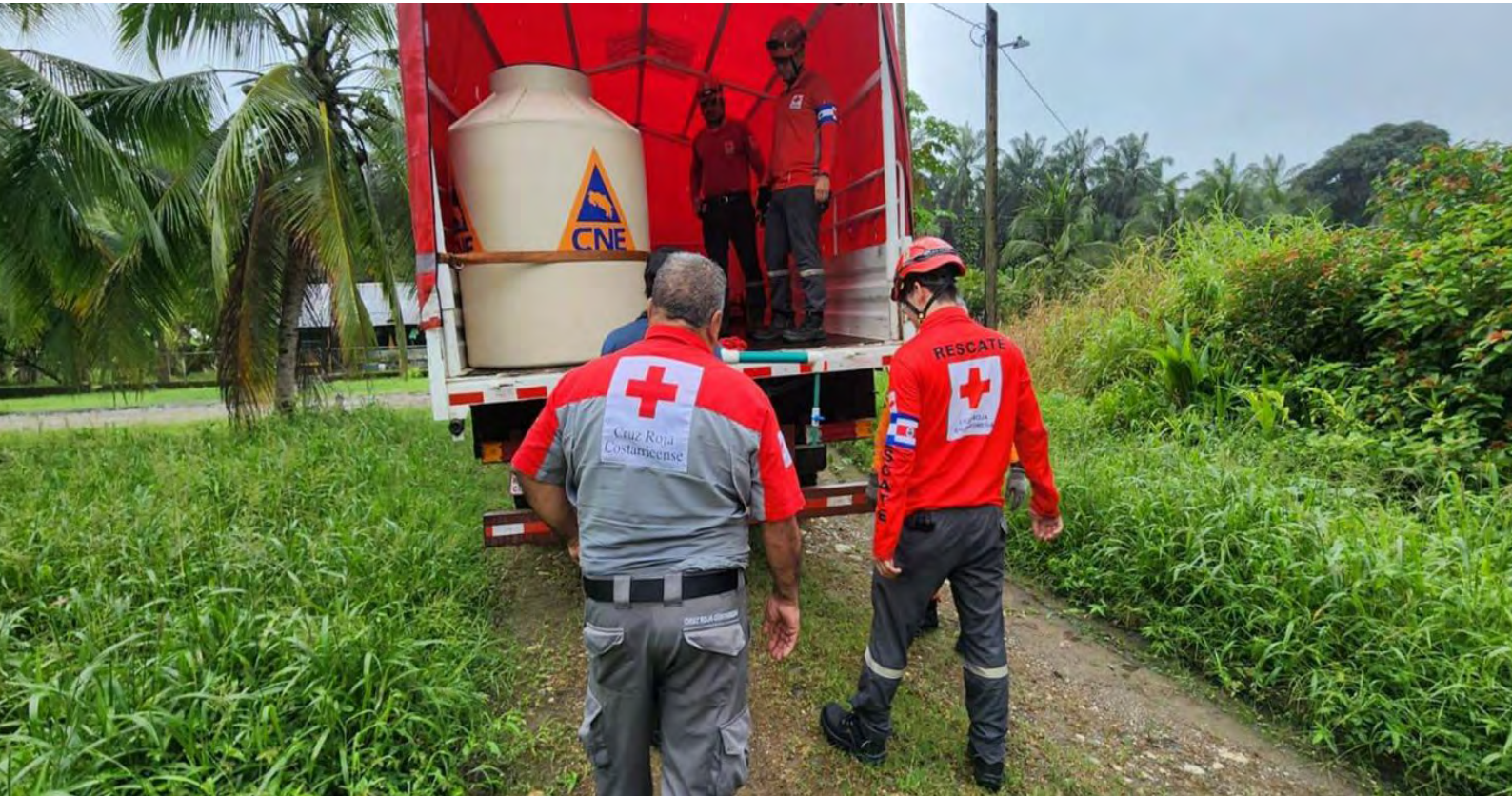
The Costa Rican Red Cross distributed drinking water to communities in the southern region affected by the heavy rains.

The IFRC will support the Costa Rican Red Cross with the monthly exchange sessions with the National Society development focal points. These meetings will promote mutual learning, the improvement of good practices and regional coordination to strengthen the operational and management capacity of the Costa Rican Red Cross.