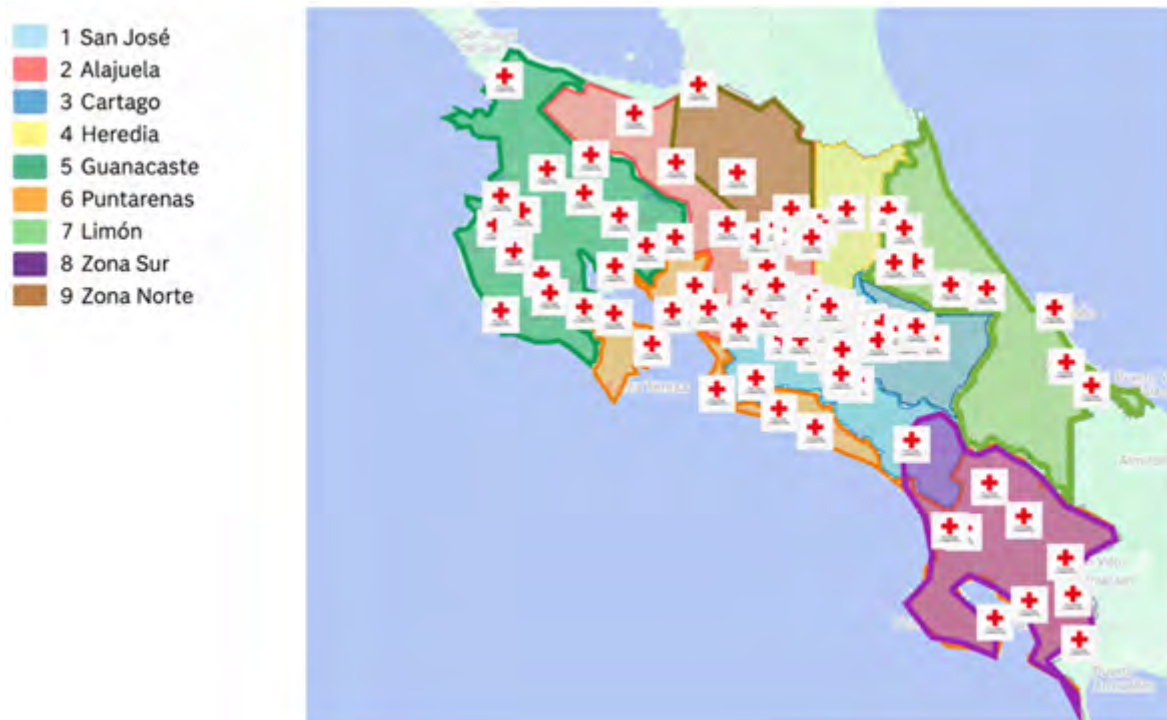
Map of the Costa Rican Red Cross branches

In 2024 , the Costa Rican Red Cross reached 22,912 people through disaster response and early recovery programmes.